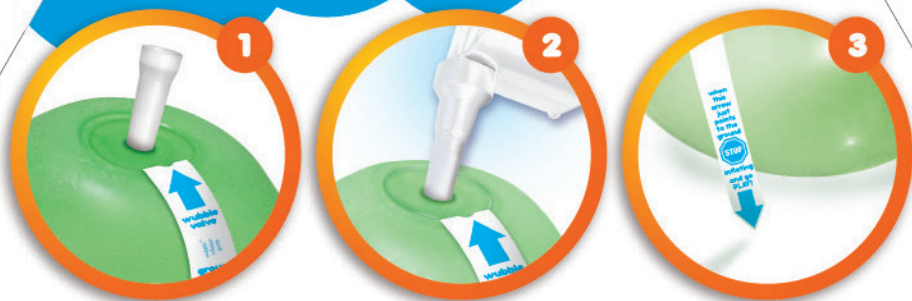
1. Secure Wubble inflation guide next to the filling port like this 2. Insert pump into nozzle and switch to "on" 3. Hold the pump in position until the arrow at the end of the inflation guide is just barely off the ground

Now... STOP FILLING YOUR WUBBLE. It is now the absolute perfect size for playing!! You can also stop filling your Wubble at any size before the inflation guide lifts off the ground.